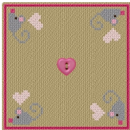
Playful Kittens Biscornu